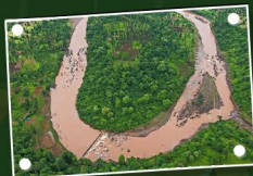
U Turn Point