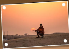
Sam Sand Dunes