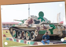
Jaisalmer War Museum