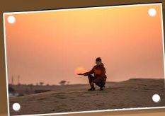
Sam Sand Dunes