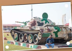
Jaisalmer War Museum